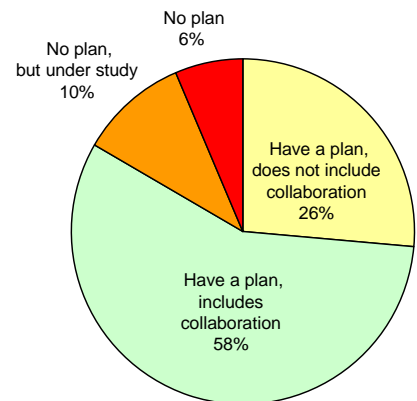
Does your company have a plan to be more environmentally friendly?