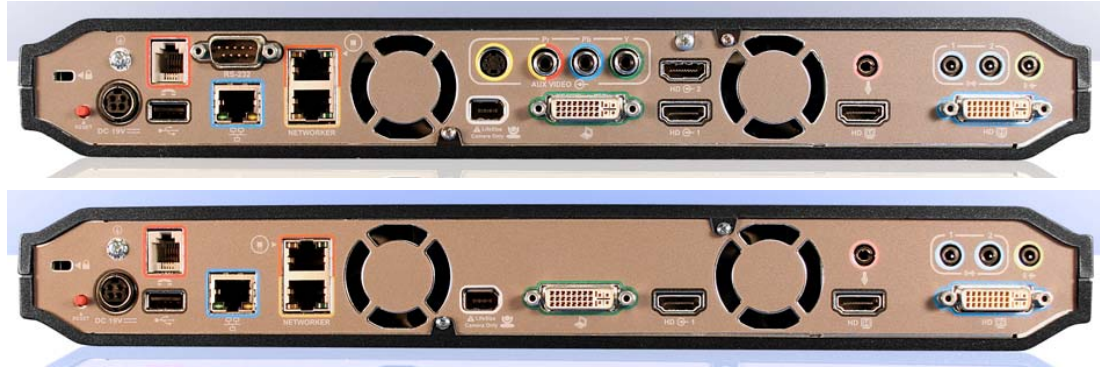
Back panels of LifeSize Room 2000 (top) and Team 200 (bottom)