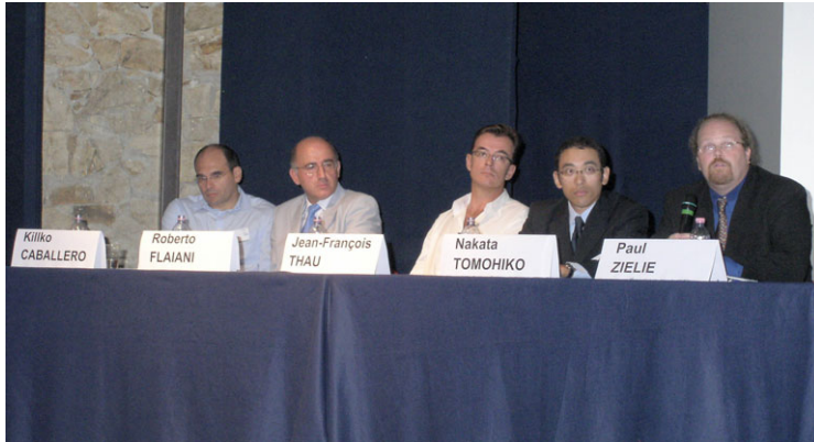
A panel of Aethra partners and resellers discussed current trends and issues in the visual collaboration space, including challenges facing channel partners.

is growing in France; and even more interesting is that Aethra has been very successful with the US military. But it would be folly to think that introducing two new endpoints is the key to success. The company desperately needs to build a North American team if it is to have any chance of growth, make its partnership with RADVISION work (a daunting task to say the least), and put some real efforts behind the stated promises of new strategy, new products, new presence, and new marketing.