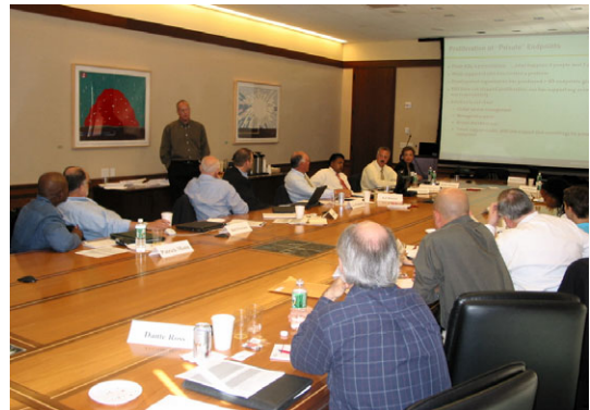
Two views of the meeting room at Bear Stearns where Wainhouse Research and 12 multinationals discussed deployment issues surrounding IP Communications.